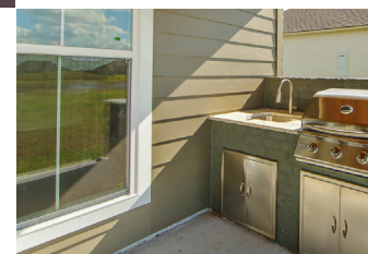
MASTERCHEF OUTDOOR KITCHENS