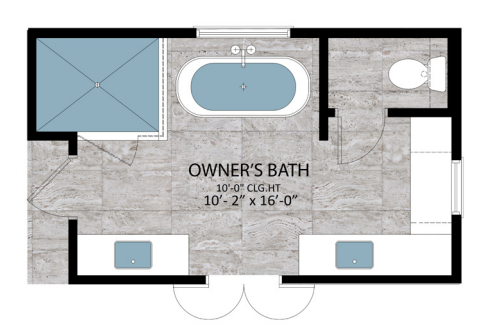
Both the Brazos A and B plans come with the upgrade option to do a free-standing tub instead of a drop-in tub.

*All upgrades must be paid upfront before construction begins.