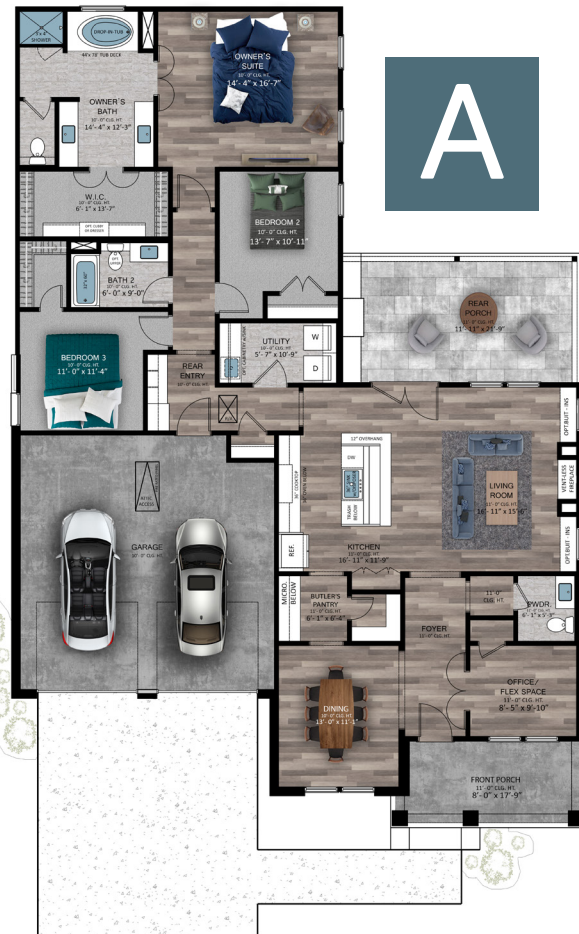
Arlington A Floorplan: