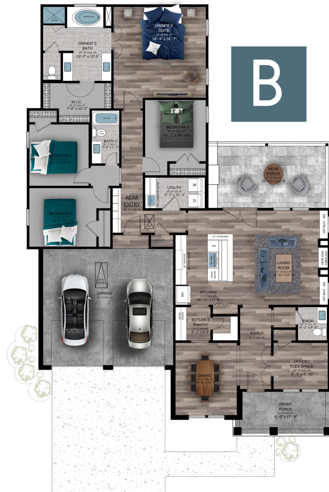
Arlington B Floorplan: