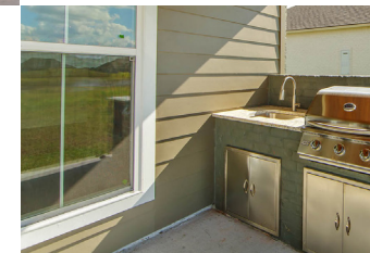
MASTERCHEF OUTDOOR KITCHENS